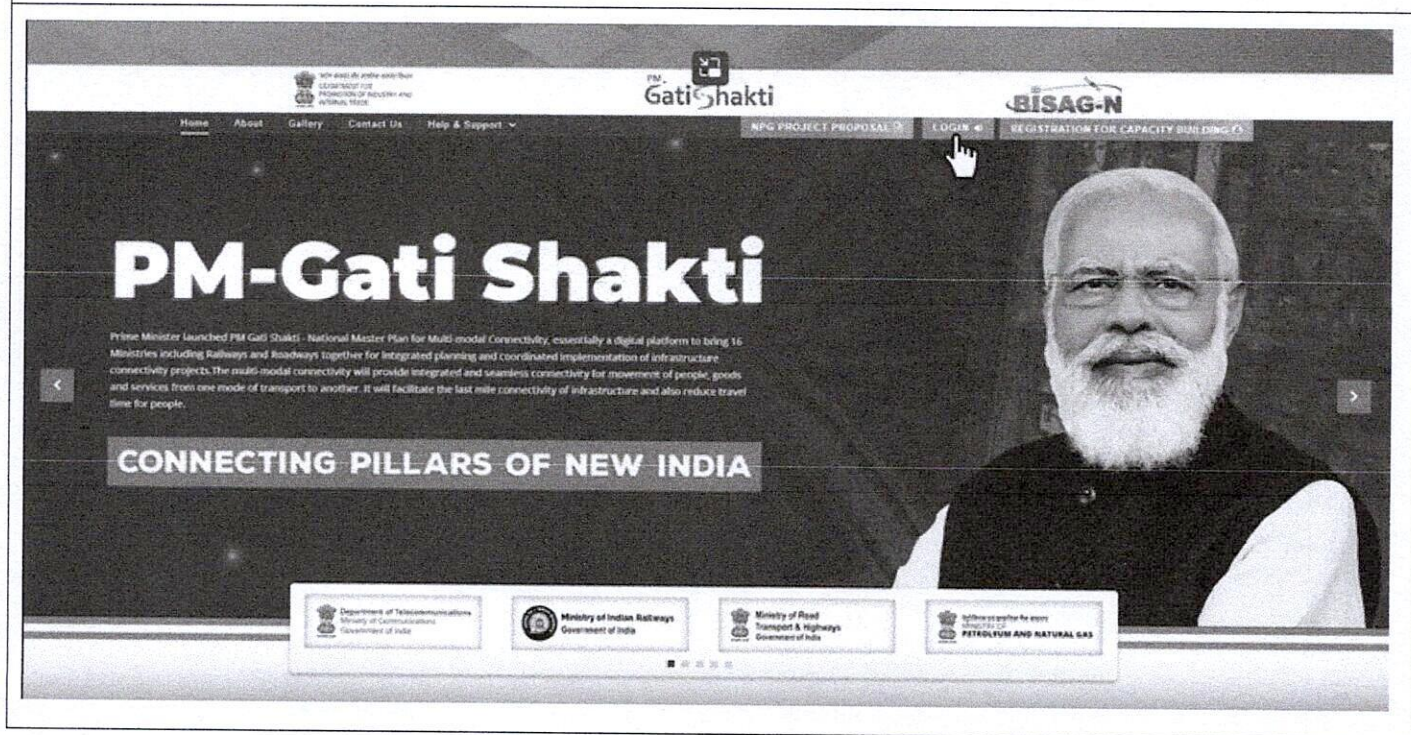
One-Time Password (OTP) based sign-in for Government officials